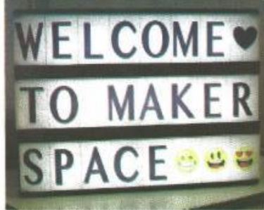
Belmont School Day School has two classrooms they have designated as Makerspace.

with cardboard. Across the hall is a room for "high technology" which is home to computers, robots, electronics and a variety of machines in need of repair.