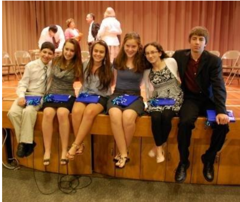
The Class of 2011