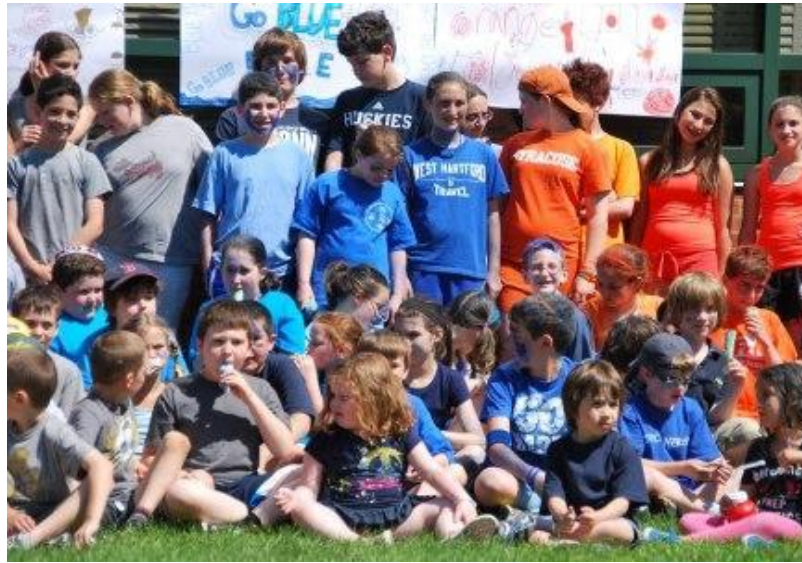
The Blue Team