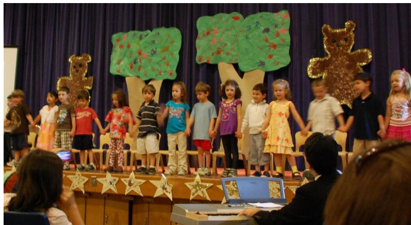
EC four "Step Up Day"