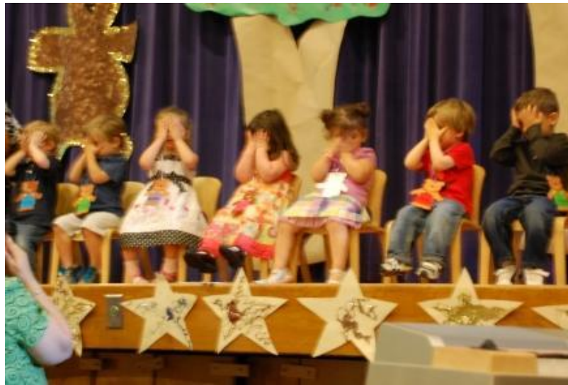
EC 2 says the Shema