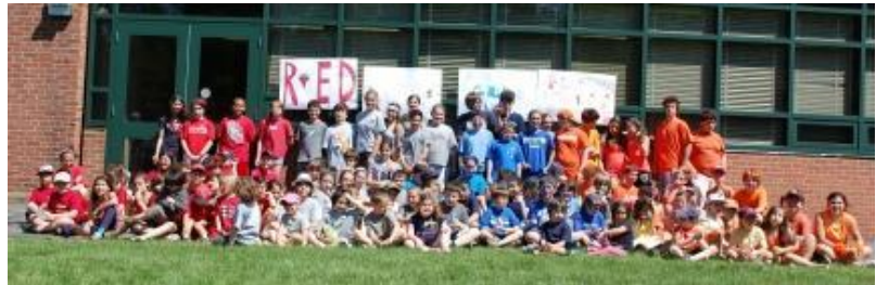
A very colorful student body!