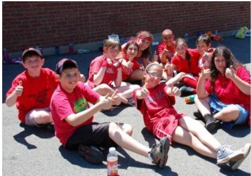
The Red Team