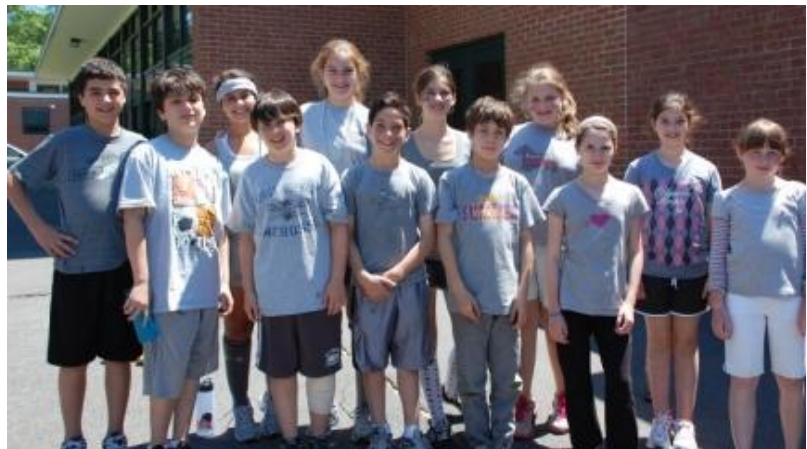
The Gray Team