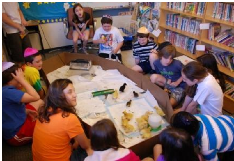
Make way for ducklings!