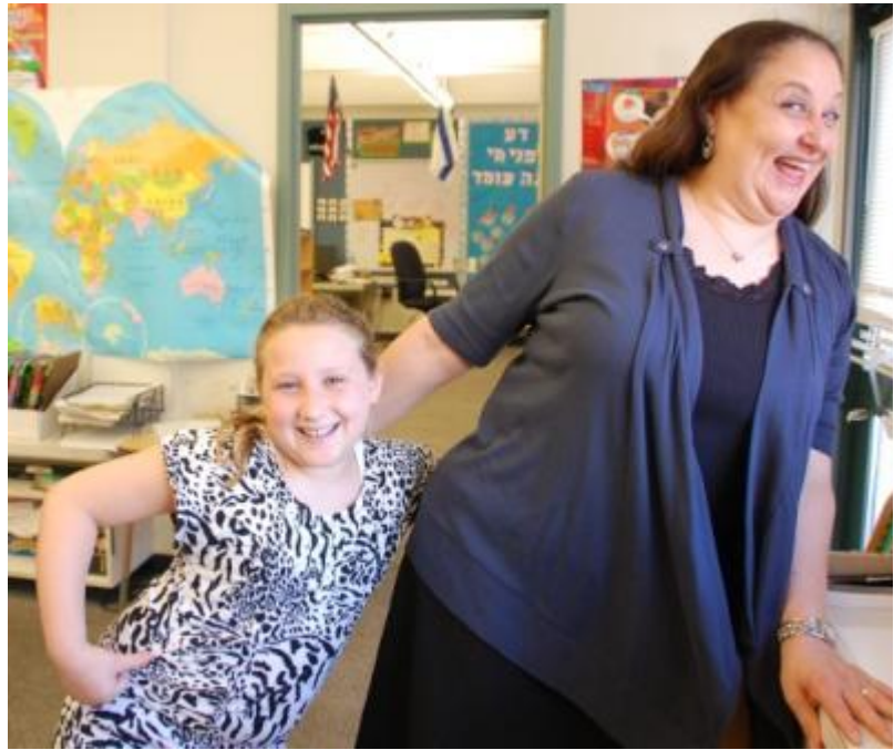
Such beautiful smiles :) !