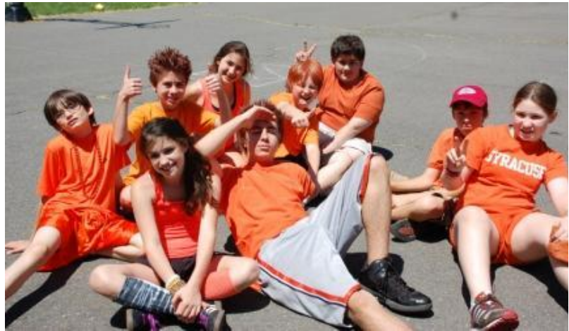
The Orange Team