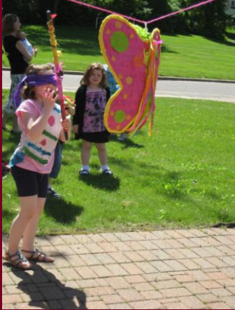
Swinging away at the pinata.