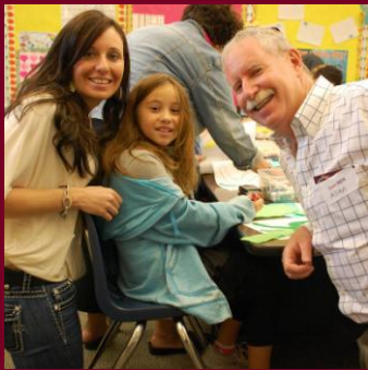
More special friends.