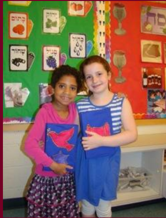
Receiving our Siddur