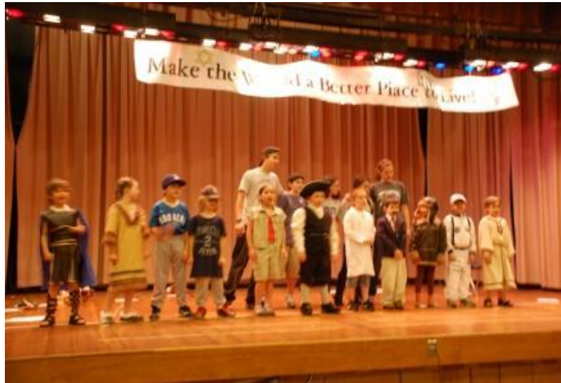
"We all need heroes." First graders, joined by eighth graders sing at the 18th annual Hero Show.