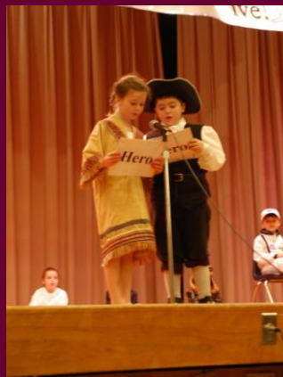
Sacajawea and Paul Revere