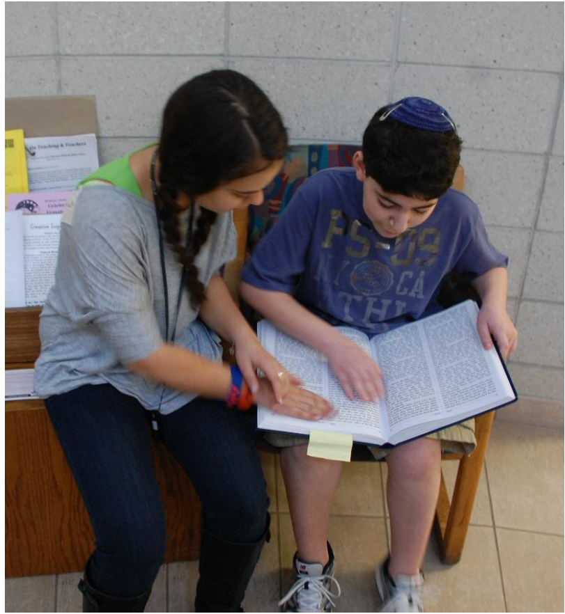
Practicing our Torah readings.