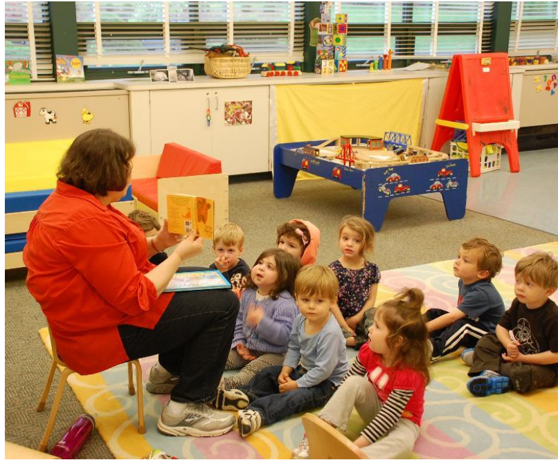
Dubonim (EC 2) enjoy a barnyard story.